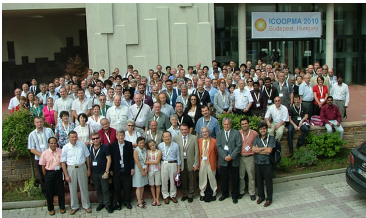
Group photograph at the ICOOPMA10, Monday, 16 August 2010