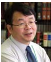
Hideo Hosono Tokyo Institute of Technology, Japan

Reversing the arrow of time via photonics using polymer-dye interactions